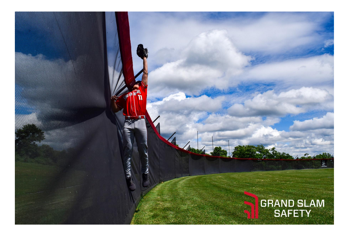
The above photo shows Grand Slam Safety's SPECTO® fence baseball netting.

Cetec ERP is a comprehensive, simple to use and powerfully designed SaaS platform aiming at industry disruption by giving ERP access at low-cost to manufacturers across the world. With all the tools growing small businesses need, Cetec ERP is a home run!